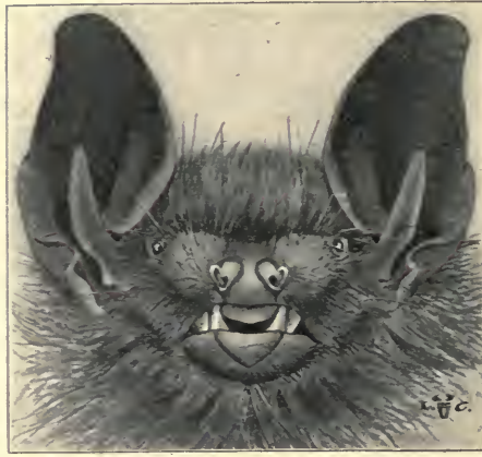
FIG. LXVI. VESPERTILIO FUSCUS. BROWN BAT.